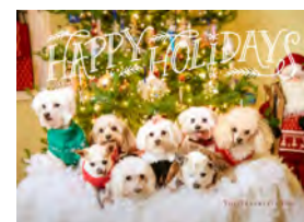
"The Trinklets," our beloved pets, all Animal Alliance alumni