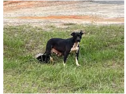
Belladonna, before rescue, had puppies in a drain pipe on the side of the road.