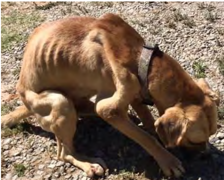
Ben, a young dog who was intentionally shot in the leg & abandoned starving, suffering and painful, now in a wonderful home where he is greatly loved.

Here are a few stories of some of the animals you recently helped us rescue, heal, care for and place in loving homes through your generosity.