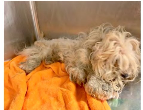
Rhett arrived to us in a group of severely neglected dogs from a hoarding case. He was so matted he could barely stand up, and was skin and bones under all that heavy, knotted, filthy fur. He's now the treasured pet of these wonderful people!