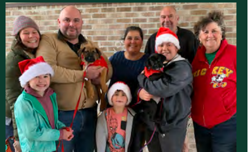
A home for the holidays! Two related families adopted 2 puppy siblings together.