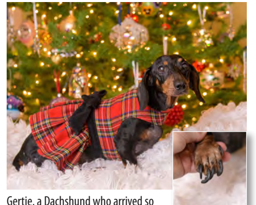
Gertie, a Dachshund who arrived so badly neglected — her nails had grown into her foot pads.